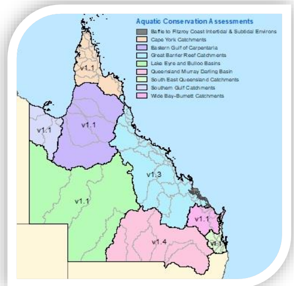
Figure 3. Areas covered by released ACAs

Further details about AquaBAMM or the ACAs can be obtained by emailing: biodiversity.planning@des.qld.gov.au