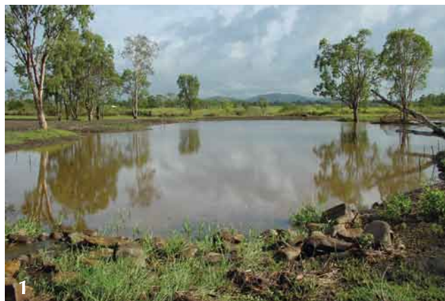
Photo 1: Prior rehabilitation works involved reclaiming an infilled lagoon

'Padaminka' is a 72-hectare holding containing small seasonal wetlands that have previously been used for agriculture (including dairying, beef cattle, goats and sugar-cane). In 2001–02, before the Pilot Program funding, the wetland had been partly restored by the excavation of infilled areas (to create deeper waterholes and rocky riffles to slow down the force of water flow). Conservation Volunteers Australia (CVA) teams helped with native tree planting and weed removal.