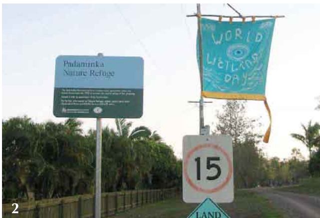
Photo 2: Entrance to Padaminka, World Wetlands Day

http://live.greeningaustralia.org.au/GA/QLD/OnGroundAction/our+projects/landforwildlife/