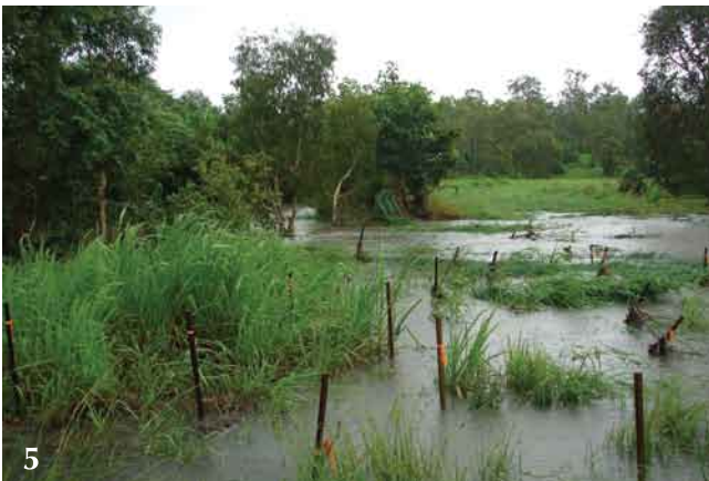
Photo 5: Flooding at Padaminka nature reserve after the project

After this project most of the marker tags and stakes were washed away by heavy flooding (see Photo 5). The flooding washed much of the para grass out of the wetlands, but did not cause any erosion because the banks were planted with specifically chosen species that had been well maintained. Considering the individual wetland and the characteristics of the plant species when revegetating a site can improve the survival rate of the plants and the longer-term success of the revegetation.