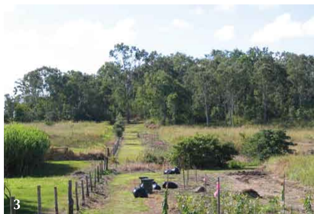
Photo 3: Western boundary fence after clearing of weeds and replanting with native species

The western boundary of the site was fenced and brush cut to create a fire break 8 metres wide; fire breaks were installed in existing wildlife corridors through the remainder of the property; and cold burns (low-intensity fires) were carried out as an extra wildfire prevention measure.