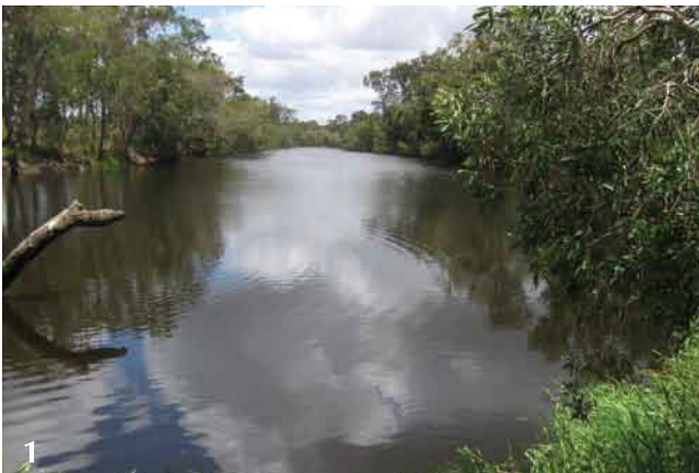
Photo 1: High-value deepwater lagoon in the lower reaches of Splitters Creek, historically a barramundi habitat

Despite overall success, sustaining momentum remains an ongoing challenge. It is also essential to make progress towards other outcomes such as tenure-based protective management (e.g. reserves) and local council planning initiatives.